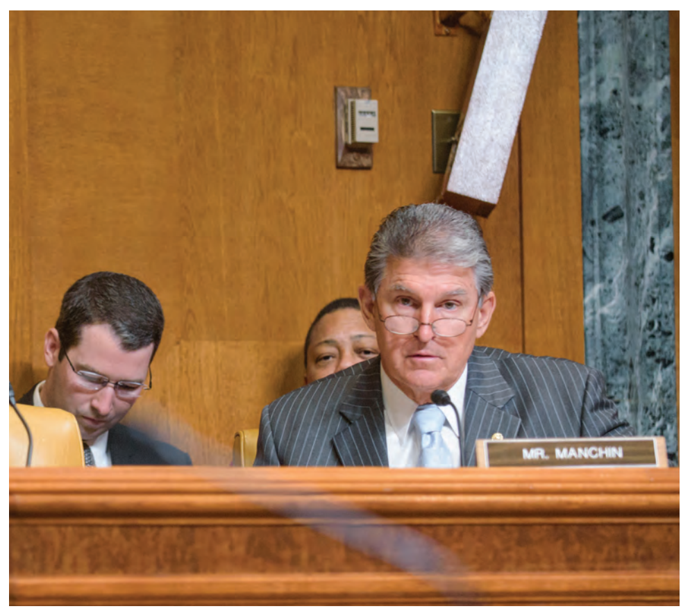
As a member of the Senate Committee on Appropriations, Senator Manchin works to ensure that federal spending is targeted toward priorities that benefit West Virginians – including broadband infrastructure

successfully reach "above extremely high-cost" areas like the nearly 12,328 locations of this nature found in West Virginia. Last February, I also introduced the Rural Telecommunications and Broadband Service Act of 2017, which calls on the FCC to form an advisory committee to define what "access to comparable services in rural America" should mean. If this legislation is enacted, the committee would develop policies and recommendations that promote deployment of broadband access in rural areas across West Virginia.