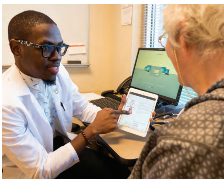
Student pharmacists participate in delivering pharmacy services to real patient's just steps away from their academic classroom and labs

Initiated in the mid-1990s, pharmacists, primarily in the northwest area of the United States, began administering influenza vaccines under collaborative practice agreements (CPA). These pioneering pharmacists were the forerunners of their modern-day peers' involvement in vaccine-preventable diseases (VPD). Today, pharmacists in all 50 states provide immunizations and assist in proactively preventing disease! While each state has differing rules that regulate the age of the patient and type of vaccination that can be provided, data clearly indicates that immunization rates have increased since the addition of nationwide pharmacist immunization certification.