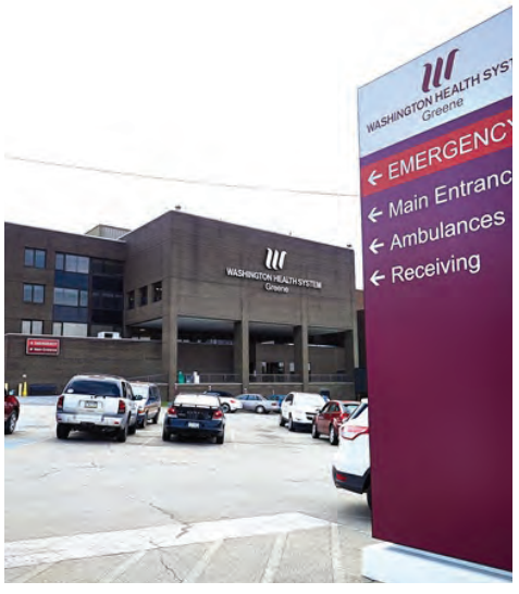
Left: WHS Washington Hospital, a 260 licensed bed facility, is the health system's flagship facility Right: The system's smaller rural hospital, WHS Greene, is a 49 licensed bed facility

Washington, Pennsylvania, and one of those small rural hospitals (49 licensed beds), WHS Greene in Waynesburg, Pennsylvania. WHS also includes a 76-bed chemical dependency hospital, Greenbriar Treatment Center, based in Washington, with a system of halfway houses and outpatient centers throughout southwestern Pennsylvania, and a large multi-specialty physician practice, Washington Physicians Group, with more than 25 offices in Washington and Greene Counties.