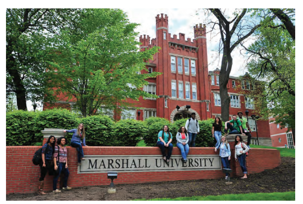
Old Main, a symbol of the University, is the oldest structure on the Marshall Campus