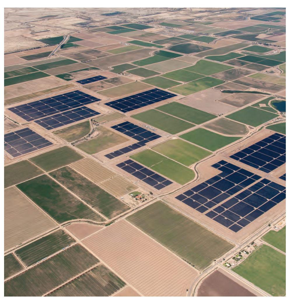
Renewable energy sources, such as solar, are an increasing part of Southern Company's energy mix