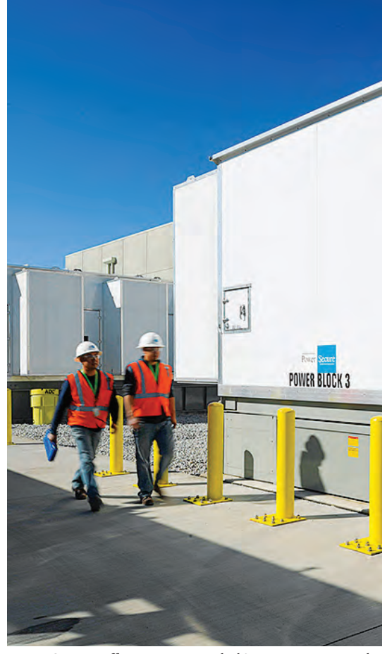
PowerSecure staff inspect a PowerBlock® generation unit in the equipment yard at Aligned Data Center's Plano, Texas facility