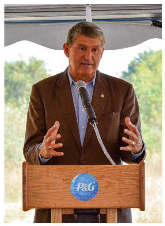
Senator Joe Manchin speaking at the Procter & Gamble groundbreaking on September 18, 2015, in Martinsburg, West Virginia

In addition to our corporate partners who reside in the Eastern Panhandle, this region boasts some of the most charming Main Streets in America, full of successful small businesses.