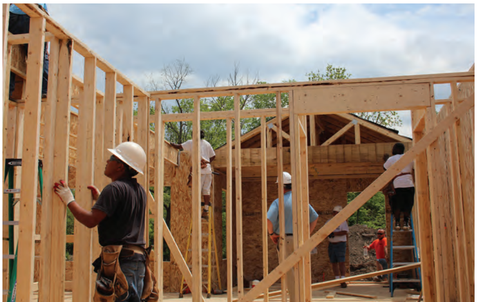
The Dan Ryan Builders and Habitat for Humanity Blitz Build

to give back and partner with the community of hard-working families that are the true lifeblood of the Panhandle.