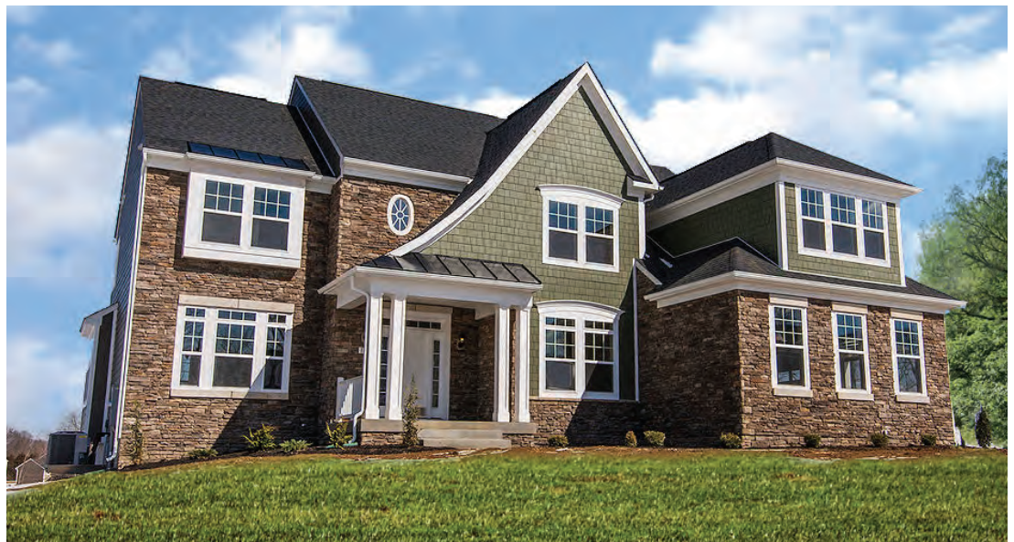
The Biltmore Model located in a Dan Ryan Builders' estate home community in Shepherdstown

I have met many of our Dan Ryan Builders' homeowners. The "power and promise of the Panhandle" is really relevant for one of those families. They were ready to own and had been looking in Frederick, Maryland. They just couldn't afford it, and they almost renewed their lease and gave up on their dream. Our sales consultant took them from Frederick to a