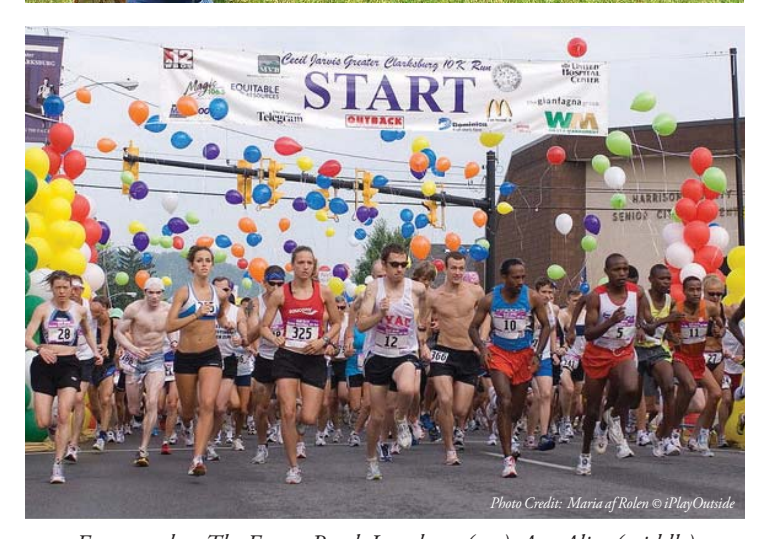
Events such as The Empty Bowls Luncheon (top), Arts Alive (middle) and the Cecil Jarvis Greater Clarksburg 10K are all supported by funds through Your Community Foundation

strengths is professional investment management of the funds individual and corporate donors entrust to us to achieve this goal. Unlike financial management companies, we offer expert guidance on the art and passion of giving. We use our expertise to make giving easy and effective, helping donors achieve their philanthropic goals.