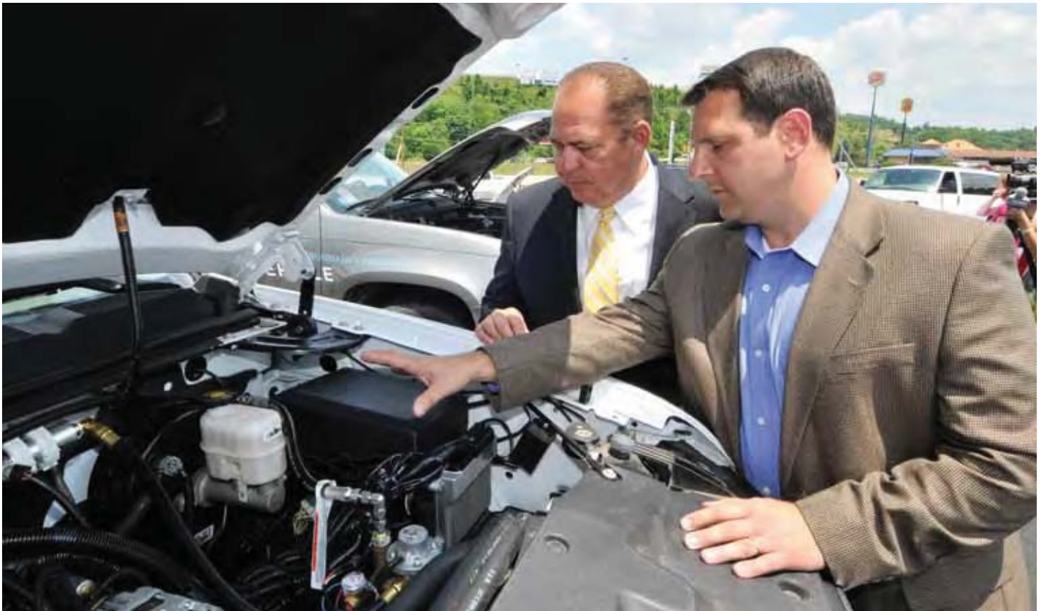
Governor Tomblin examines a bi-converted engine, that runs on natural gas or unleaded gasoline, with Buzz Tabone of Zoresco Equipment Co., the company responsible for the engine conversion.

of the State of West Virginia's vehicular fleet to a natural gas-fueled model. This task force has been meeting throughout the state and has been evaluating the financial implications associated with conversion of the fleet and development of the necessary natural gas fueling station infrastructure for our fleet. It will analyze the infrastructure needs and logistical elements of establishing the same. It also will make recommendations on the state's motor vehicle fuel tax to reflect utilization of natural gas as a vehicular fuel, along with such legislation which may be needed to accomplish that objective. Finally, the task force will advise us on how to proceed with educating the general public on the attributes of conversion from gasoline and diesel to natural gas as a fuel.