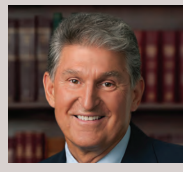
Joe Manchin United States Senate

Senator Shelley Moore Capito (R-W.Va.) is the first female U.S. Senator in West Virginia's history. She is a member of the U.S. Senate Committees on Environment and Public Works; Commerce, Science and Transportation; Appropriations; and Rules and Administration.