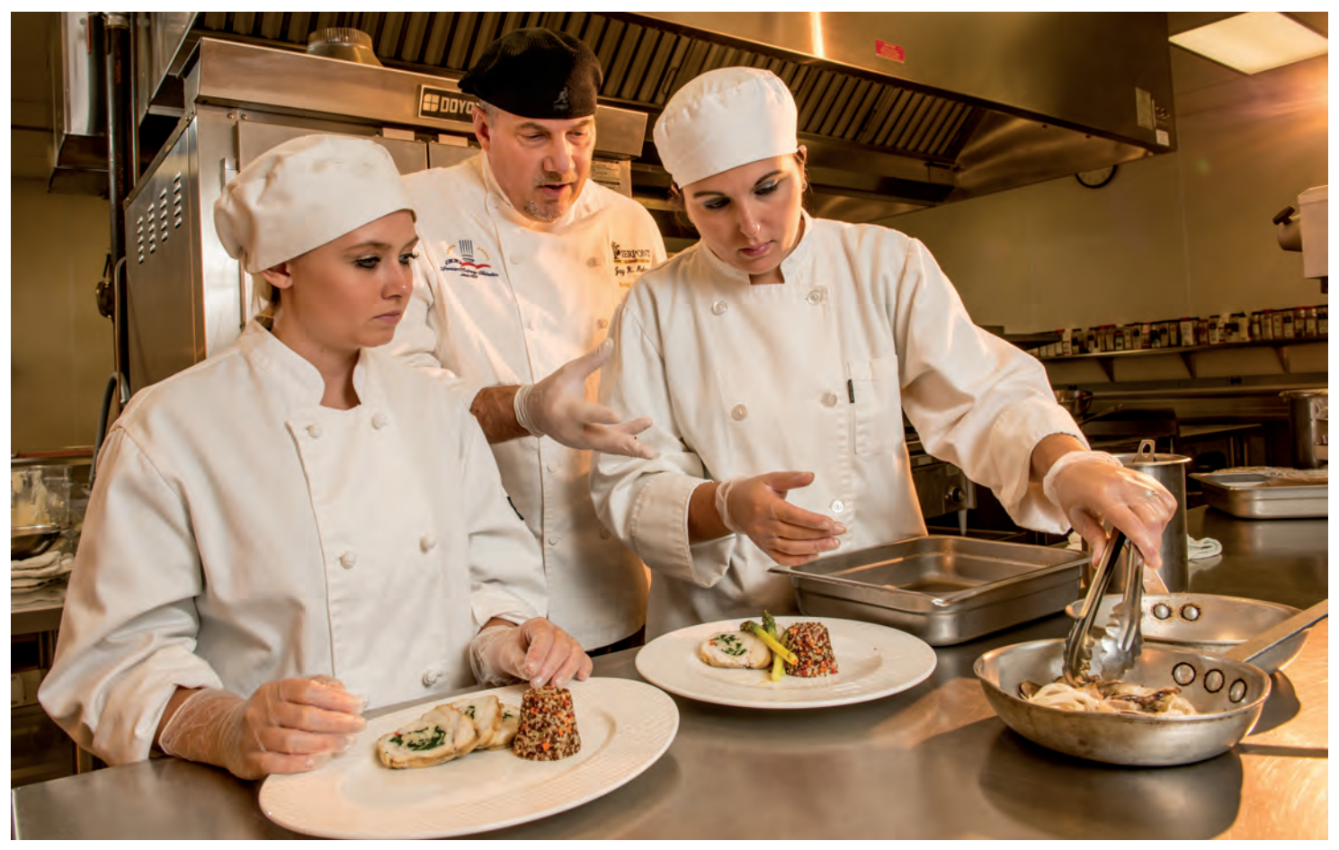
The Food Service Management associates degree program at Pierpont Community and Technical College offers students four focus areas, including: Dietary Manager, Resort & Hotel Management, Culinary Arts and Pastry and Baking Arts.

associate degree in Powersports Technology, arming them with the skills they need to service, repair and maintain powersports equipment – including ATVs and personal watercraft. In a region that is the proud home of the Hatfield-McCoy trail system, programs like this can lead to great jobs.