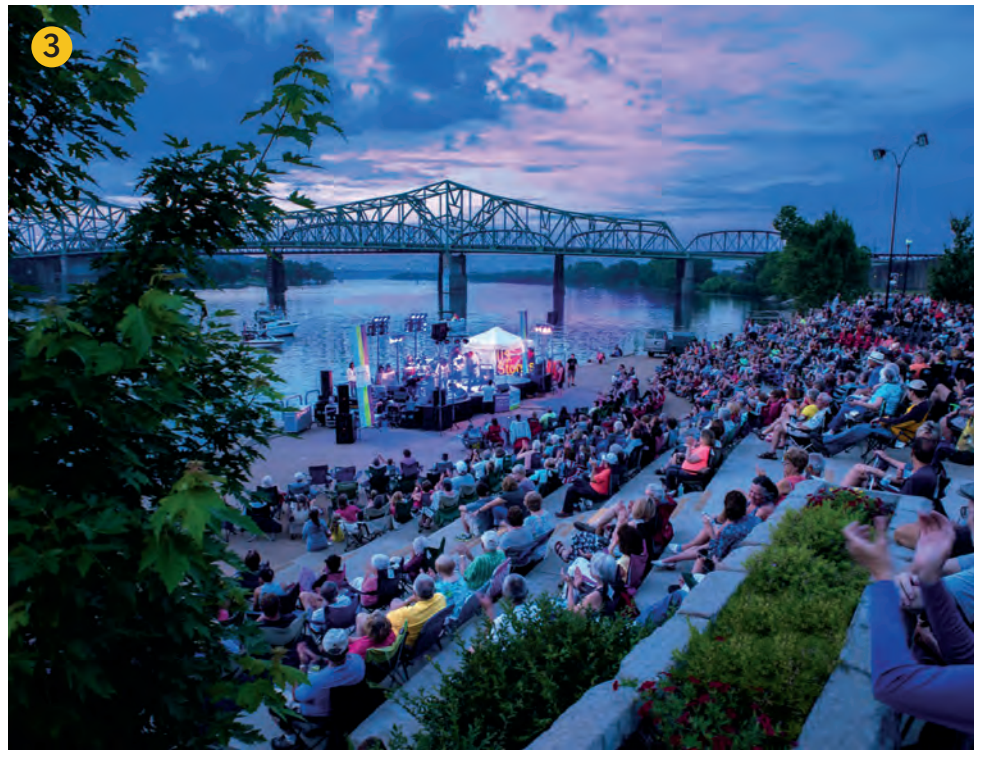
Image 1: The annual Taste of Parkersburg, which is held in the springtime, offers attendees a venue featuring a mix of food, wine and music. Image 2: The Blennerhassett Hotel is a historic, full-service hotel located in Downtown Parkersburg. Image 3: The Point Park Concerts on the River are free events held on the first Friday of the month from June through September.