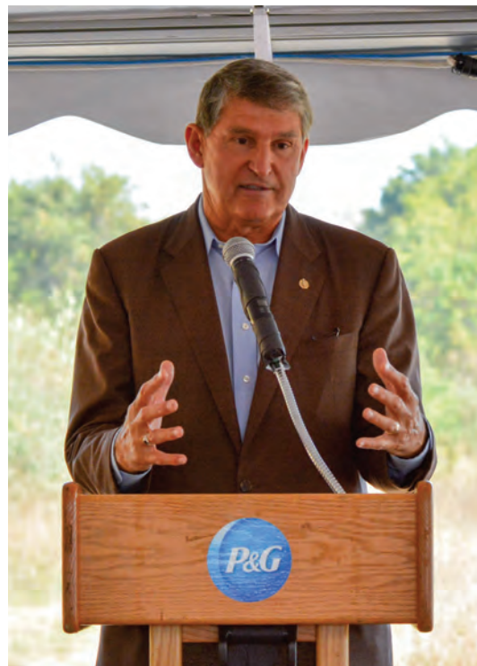
Senator Joe Manchin speaking at the Procter & Gamble groundbreaking on September 18, 2015, in Martinsburg, West Virginia

In addition to our corporate partners who reside in the Eastern Panhandle, this region boasts some of the most charming Main Streets in America, full of successful small businesses.