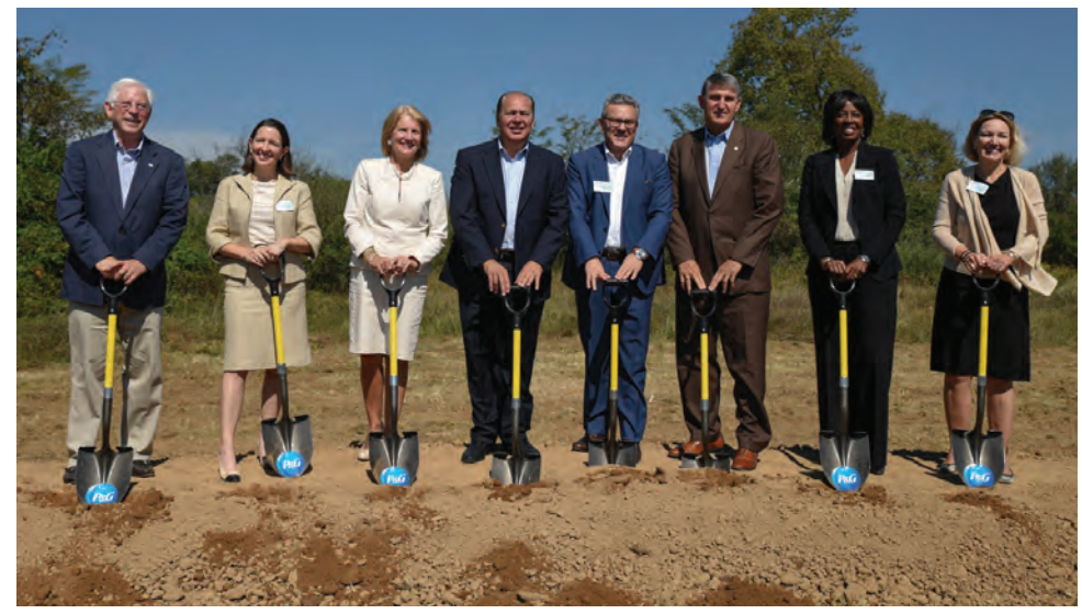
In September 2015, Governor Earl Ray Tomblin joined executives from P& G for the company's groundbreaking of the new $500 million facility located in the Eastern Panhandle, bringing 1,000 construction jobs and 700 full-time positions to West Virginia