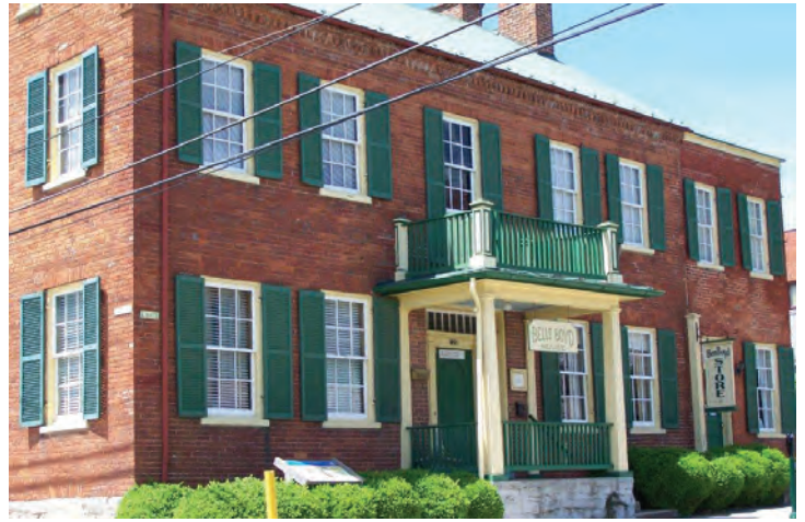
Clockwise from left: the ARTS Centre, the Caperton Train Station, the Belle Boyd House

Historic downtown Martinsburg also continues to see redevelopment as several buildings have recently been purchased by new owners. New developments have come in technology, retail, services and restaurants.