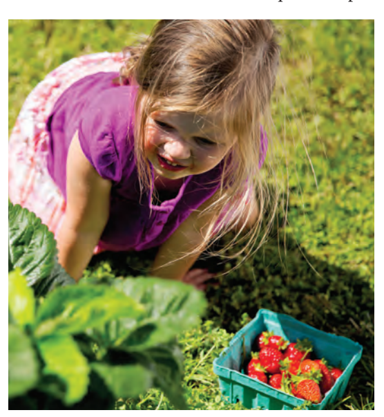
Orr's Farm Market, Martinsburg, West Virginia

More than 1.5 million overnight trips are taken to the place where our nation's civil rights movement was born and where you can still step back in time to cobblestone streets lined with quaint shops.