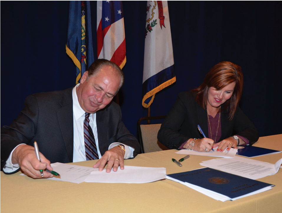
Governor Earl Ray Tomblin and Lieutenant Governor Mary Taylor of Ohio sign the regional agreement document which highlights and promises a future collaboration between West Virginia, Ohio and Pennsylvania during the 2015 Tri-State Shale Summit

Our Governor's Guaranteed Workforce Program is always looking for innovative ways to help new and expanding businesses train, retrain and upgrade the skills of their employees. Advancing our workforce through these educational partnerships and training programs is an investment with a lasting, invaluable return – a future that is bright and prosperous for West Virginia and her people.