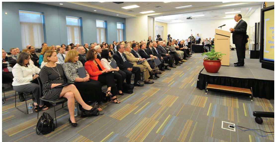
Governor Earl Ray Tomblin speaks during the West Virginia Workforce Summit on May 5, 2015

Much as we hear the "Gulf Coast" being a petrochemical hotbed, rather than about Texas, Louisiana, Mississippi and Alabama individually, we must work to promote the "Appalachian Basin" as an outstanding place for companies to locate and expand. Gas and oil reserves in our region will sustain projects and create jobs for